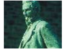
In 1865 Ezra Cornell had a vision.

You are also connected to the knowledge and resources of Cornell University, a leading global research university. eCornell courses offer embedded “Ask the Expert” interviews with Cornell faculty, online access to library reference guides, and additional professional and executive education opportunities at Cornell University.